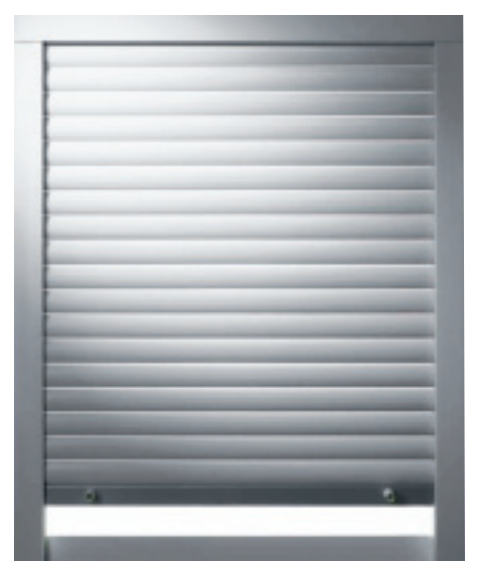
Elegant protection from light, heat and nosey parkers. Comfort-Design Plus

The roller shutter system Comfort-Design Plus provides you with a range of attractive advantages: From visual cover and light protection to thermal insulation. Burglary attempts can be hampered. Construction set 195 is available in classic white with a crank gear or electrical drive option and, if required, with an additional fly-screen.